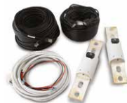
Battery breaker enclosure fuse kits (500 A/1,000 A)