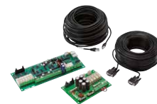
Third-party switchgear kit